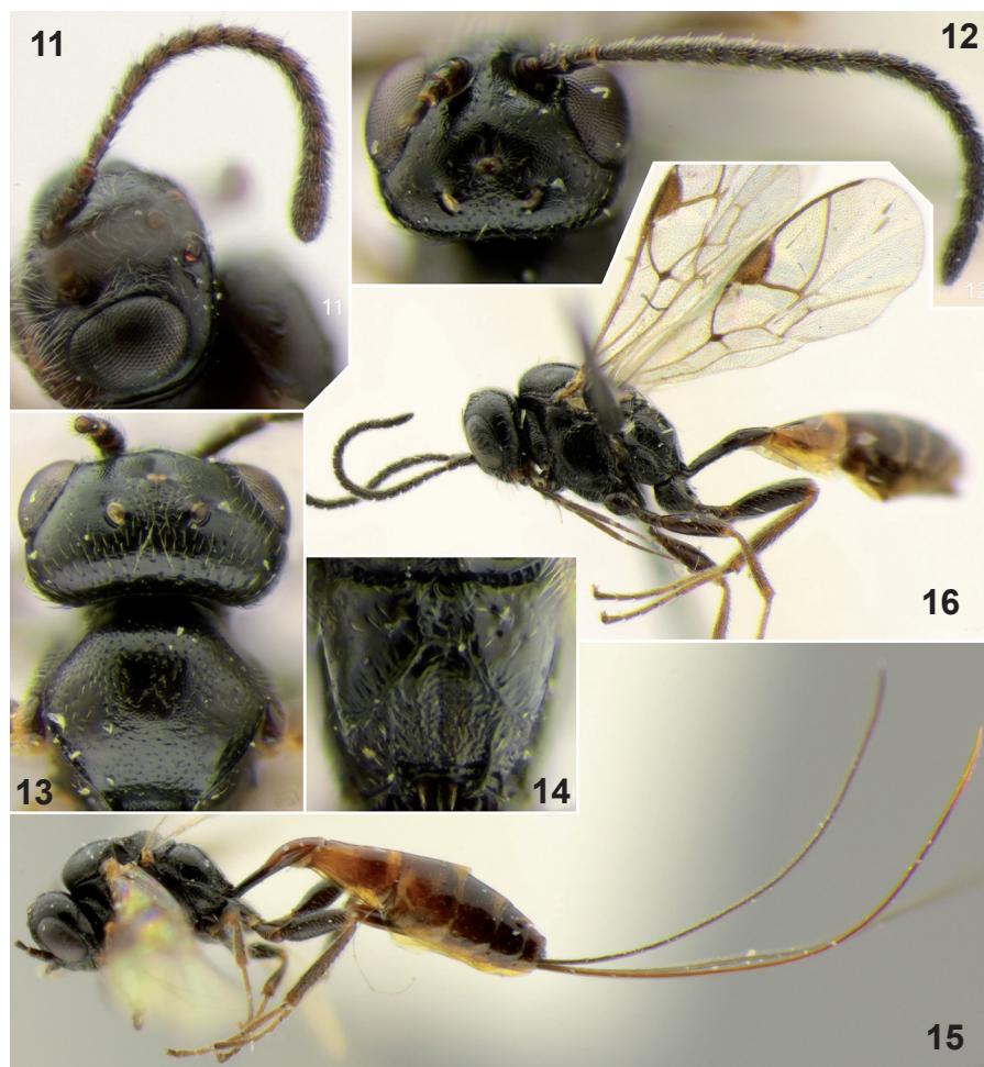
Figs 11–16: (11) Gelanes clavulatus , female, head with antenna; (12–16) Palpator turpilucricupidus , female (12–15) and male (16): (12) head with antenna; (13) head and mesoscutum, dorsal view; (14) propodeum, dorsal view; (15, 16) habitus, lateral view.

Biology: Reared from Xyela sp. (Xyelidae) on Pinus nigra Aiton in Greece; collected on and reared from P. halepensis Mill. in Croatia; reared from Xyela curva Benson and X. graeca Stein on P. nigra in Austria (Khalaim & Blank 2011).