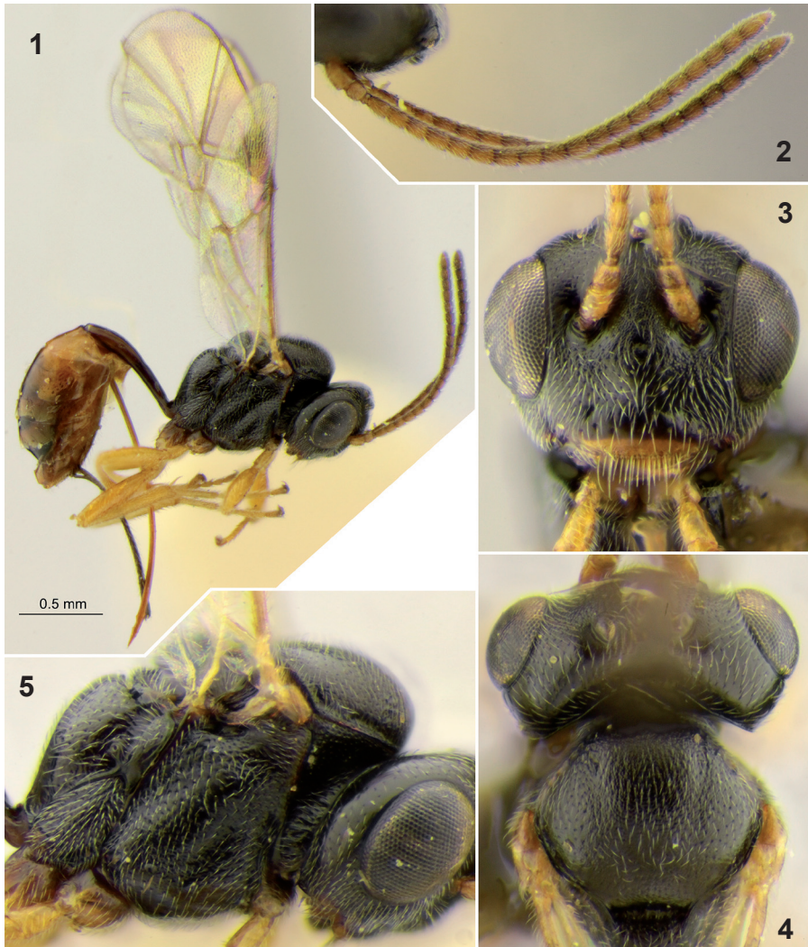
Figs 1–5: Diaparsis gerlingi n. sp., holotype female: (1) habitus, lateral view; (2) antennae, lateral view; (3) head, front view; (4) head and mesoscutum, dorsal view; (5) head and mesosoma, lateral view.

mesopleuron. Mesopleuron distinctly and densely punctate, smooth and shining between punctures. Propodeum (Fig. 7) with basal keel which is 0.35 times as long as apical area. Dorsolateral area finely punctate on very shallowly granulate or smooth background, weakly shining to dull. Propodeal spiracle separated from pleural carina by 3.0–4.0 times diameter of spiracle. Apical area slightly impressed along midline or flat, pointed anteriorly (Fig. 7).