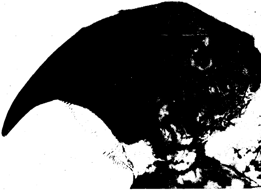
Fig. 3. Mandible of the adult coccinellid beetle Chilocorus bipustulatus .

information about prey consumed during the 48 hours prior to dissection, but not earlier. The empty guts of beetles collected in the citrus grove between November and January suggest that the beetles virtually did not feed at all during that period, although prey was available in the study plot. This may have been due to adult diapause, which is known to occur at that time (Tadmor and Applebaum, 1971).