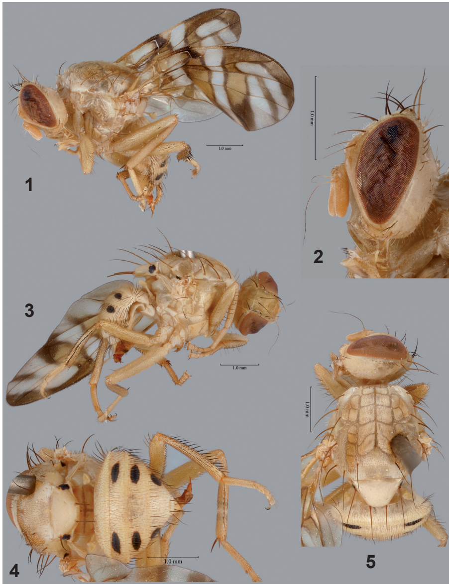
Figs 1–5: Alujamyia octopuncta : (1) female holotype, Costa Rica, Cerro Puma (INBioCRI0003826274), habitus, left lateral; (2) same, head, lateral; (3) female paratype, Costa Rica, Cerro Puma (INBioCRI0003780172), habitus, right lateral; (4) same, abdomen, dorsal; (5) same, thorax, dorsal.