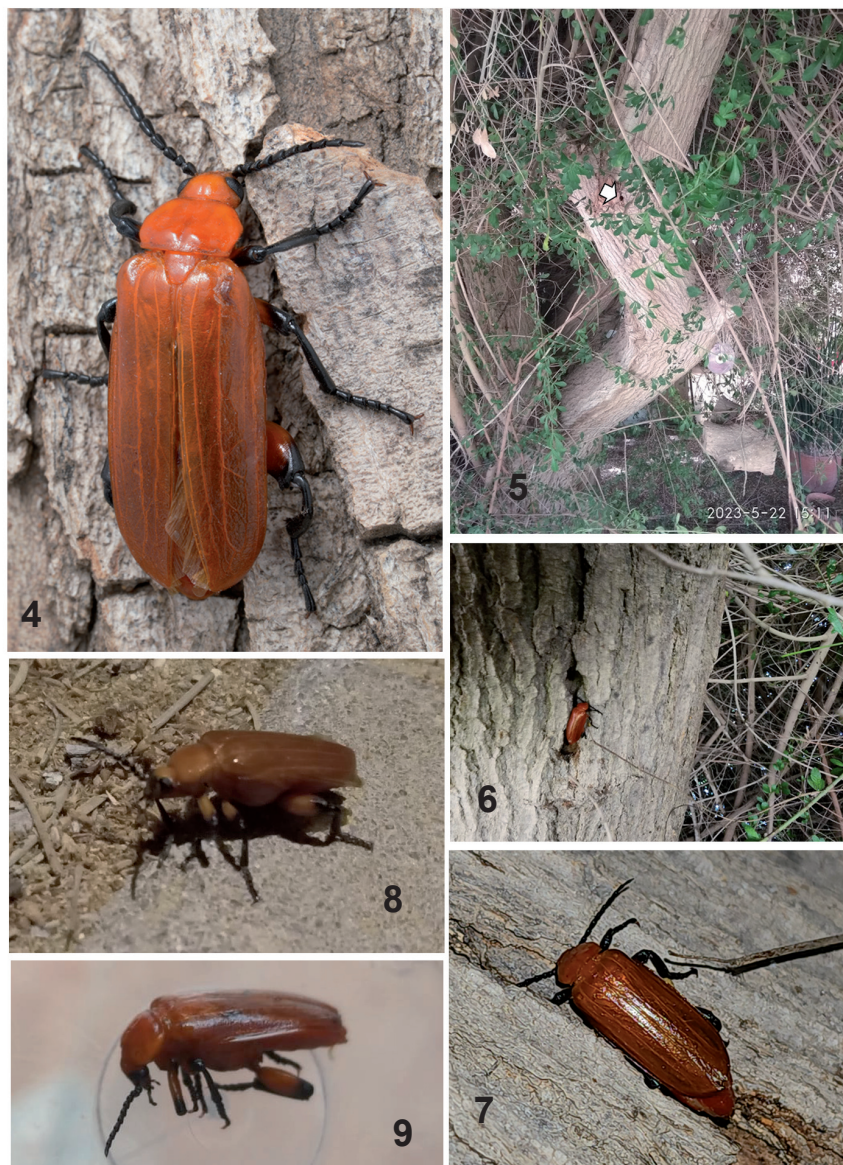
Figs 4–9. Horia fabriciana : (4), male, dorsal view, from Magen; (5) Magen, the mulberry tree, housing the nest of Xylocopa pubescens , one of the holes shown with white arrow; (6) Magen, H. fabriciana sitting in the bark crevice, close to the entrance hole; (7) ibidem , enlarged; (8) H. fabriciana male walking on the ground in Kemehin; (9) H. fabriciana male found in the nest of X. pubescens in the shade beam in Ashdod.